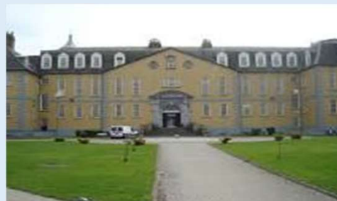
HSE – National Endoscopy Clinical Information System