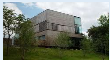
National Virus Reference Laboratory

“Better Information – Better Decisions – Better Care”