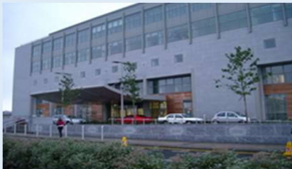
St. Vincent's University Hospital