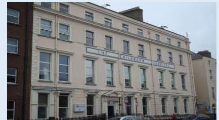
Children's University Hospital